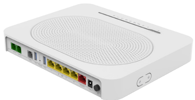
TG799TSvac Xstream back panel

TECHNICOLOR WORLDWIDE HEADQUARTERS 1-5, rue Jeanne d'Arc 92130 Issy-les-Moulineaux, France Tel: +33 (0)1 41 86 50 00 - Fax: +33 (0)1 41 86 58 59